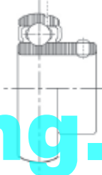
SSB200G Relubricatable Type