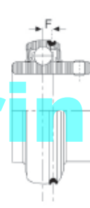
OUC200G (Normal Duty) Relubricatable Type