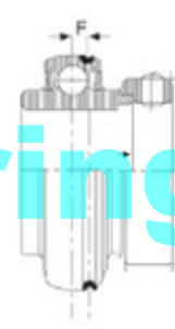
HC200G (Normal Duty) Relubricatable Type